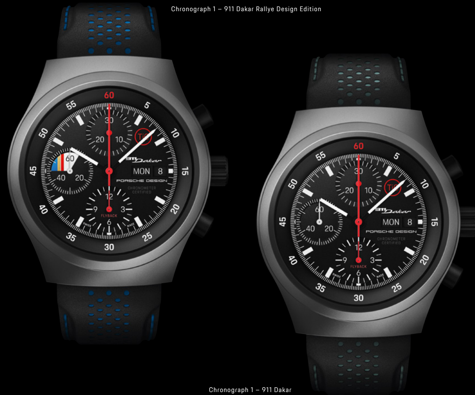
Chronograph 1 – 911 Dakar