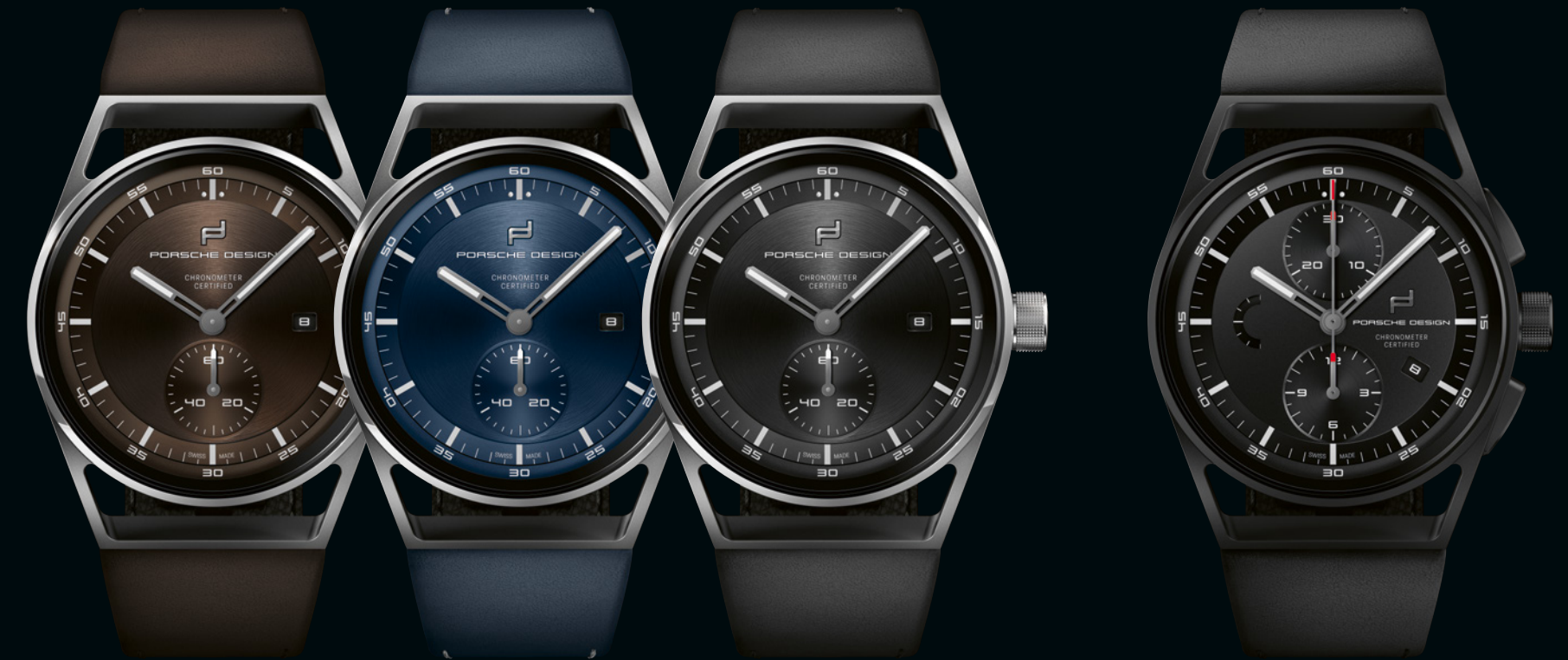
SPORT CHRONO SUBSECOND TITANIUM & BROWN

With the Subsecond timepiece, for the first time in the history of Porsche Design, a timepiece is being released in two different case sizes: the familiar 42 mm version, and a new 39 mm version.