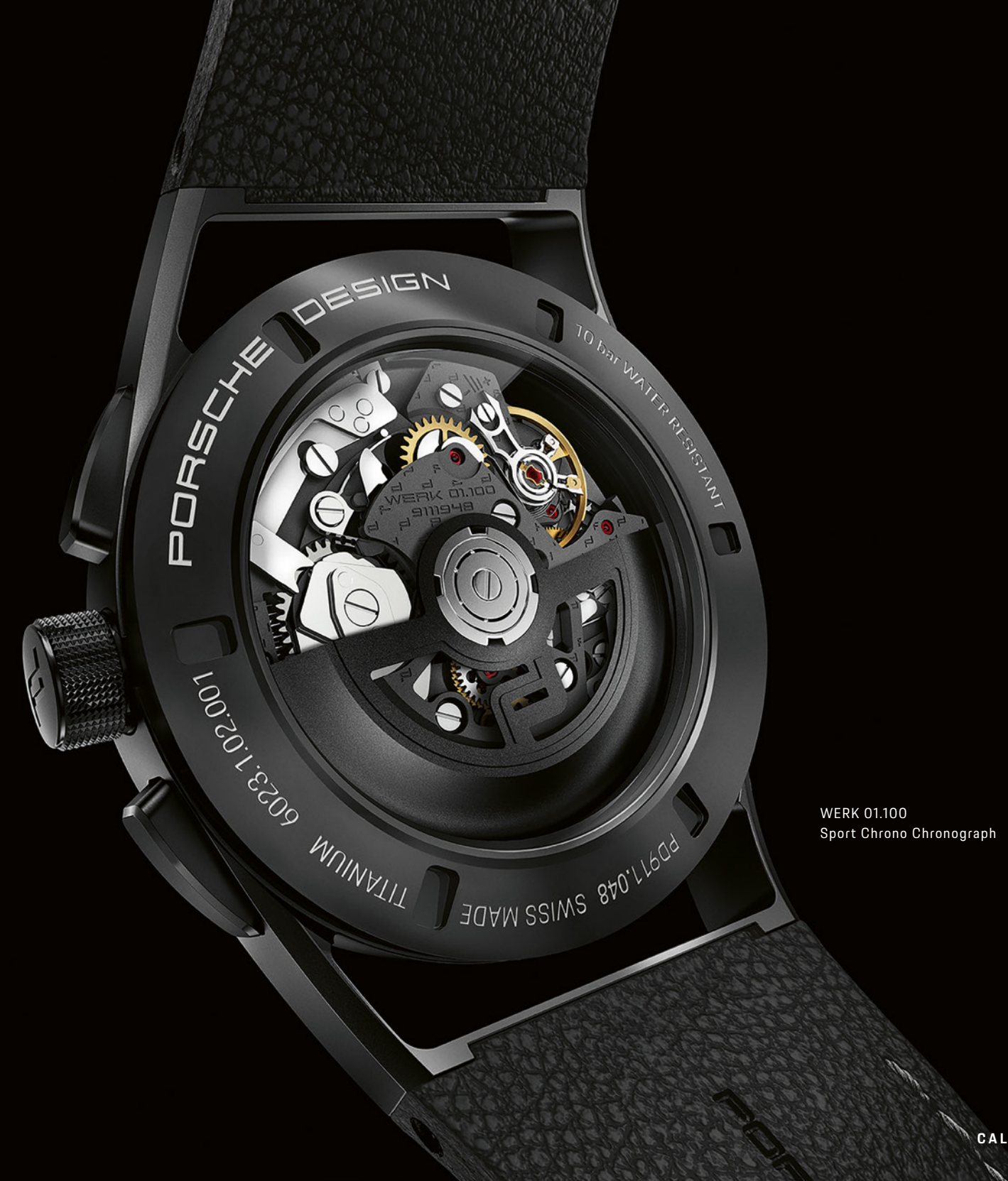
WERK 01.100 Sport Chrono Chronograph

combination of attention to detail and technical expertise. This perfect symbiosis has been translated into high-quality timepieces in Solothurn since 2014 – at Porsche Design's own watch manufactory, Porsche Design Timepieces AG. There, engineers and watchmakers work side by side to ensure maximum performance out of each model. To make each design even more timeless. And to bring the accustomed Porsche quality not only into vehicles, but also to wristwatches. Bringing an entirely new kind of value to every second.