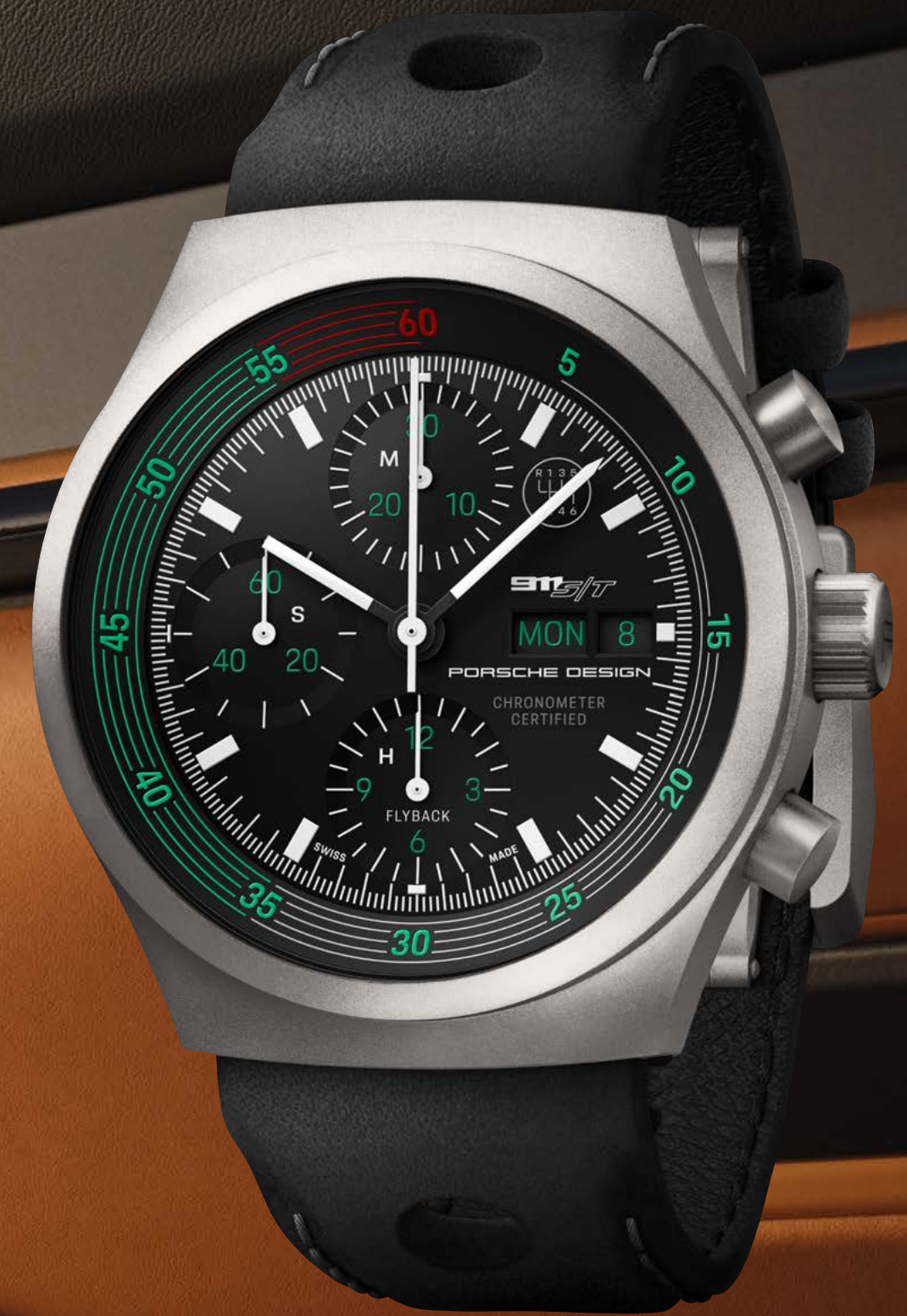
Chronograph 1 – 911 S/T