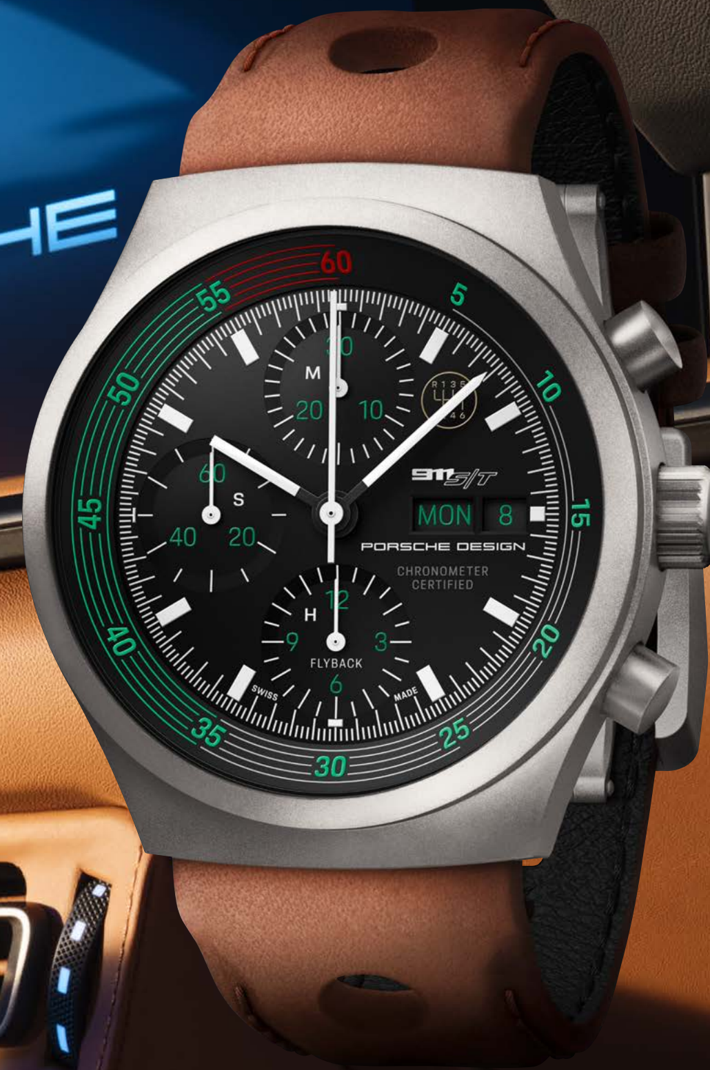
Chronograph 1 – 911 S/T Heritage

If you analyze the function of an object, its form often becomes obvious. As a result, everything looks as if it is made from a single piece – even if it's made of leather. The leather straps reflect the lightweight construction concept of the 911 S/T, with a symmetrical hole pattern that dispenses with every unnecessary milligram. This is how traditional craftsmanship is combined with modern motorsport technology. The vehicle leather and interior thread used form even closer ties between the sports car and chronograph. The titanium bracelet, including the folding clasp with the laser-engraved Porsche Design logo, consistently echoes the lightweight construction concept and minimizes the power-to-weight ratio on your next fast lap. So the choice is anything but easy, but no matter which version you choose, you will always have the history of 60 years of the 911 on your wrist.